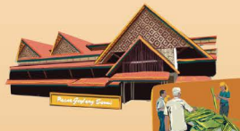
GEYLANG SERAI MARKET